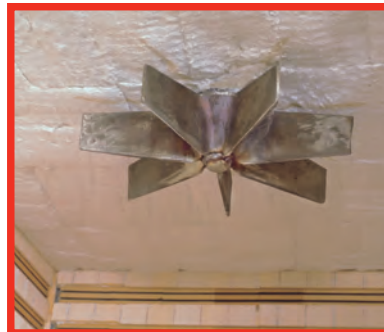
High temperature 18" fan