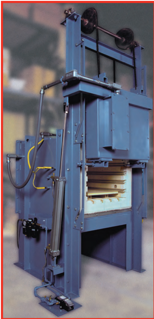
XLE 814 with pneumatic vertical door